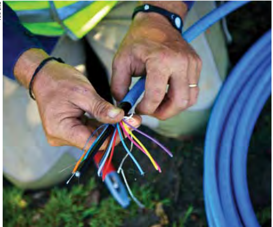
MEASURING UP: Maximising return on investment for taxpayers

Six-monthly progress reports sought on rollout.