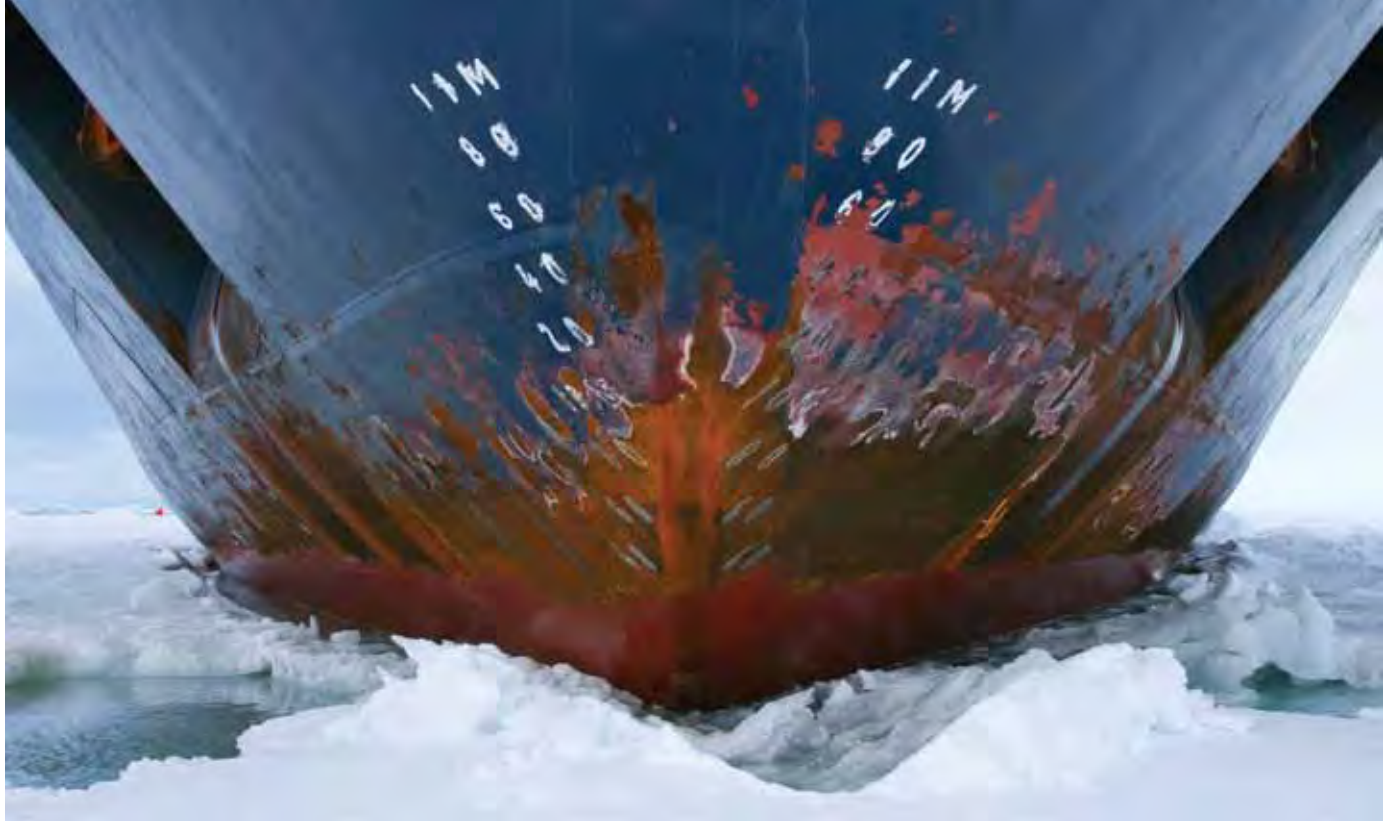
ICE BREAKER: Heavy oil ban to help save pristine environment