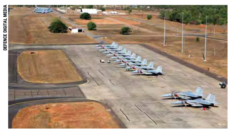
BACK TO BASE: Maintenance measures to be implemented

www.aph.gov.au/economics economics.reps@aph.gov.au (02) 6277 4587