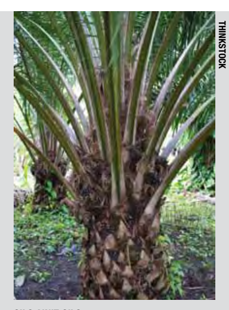
OILS AIN'T OILS: Support for labelling bill dissolves