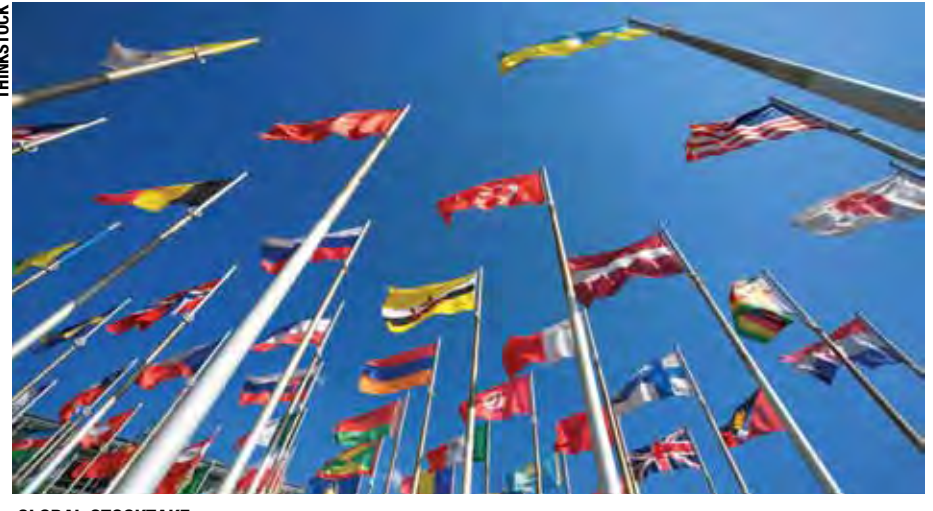
GLOBAL STOCKTAKE: Concerns about diplomatic under-representation