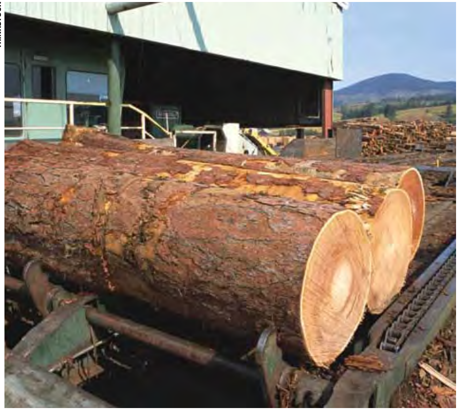
FOREST FLOOR: High-quality native hardwood still in demand